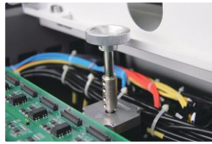
Auto height detector for up to 100 mm thick of material