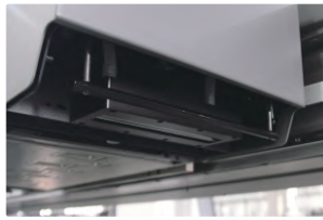
Dual water-cooling LED UV lamps for a wide range of substrates