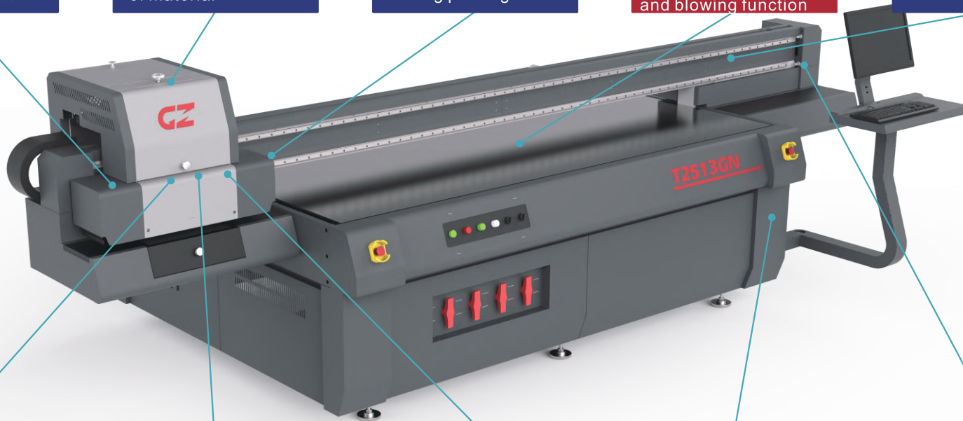
Up to 8xRicoch Gen5 with 4 levels greyscale printing