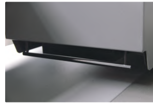
Anti-collision device prevents PH damage during printing