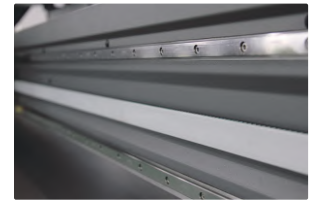
Dual linear guides assure quite and stable movement